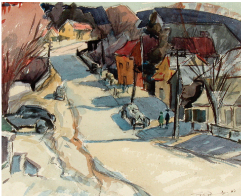
Village Street by Ralph Connor

Choose from three works by local artists in KWAG's Permanent Collection: