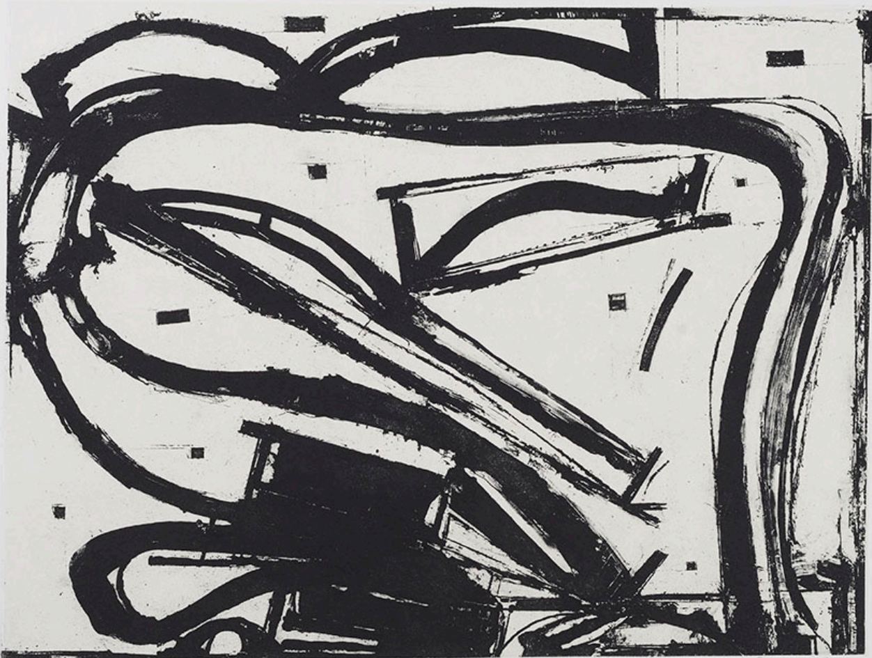
Blandford Chase , 2013 1/10 Ron Shuebrook